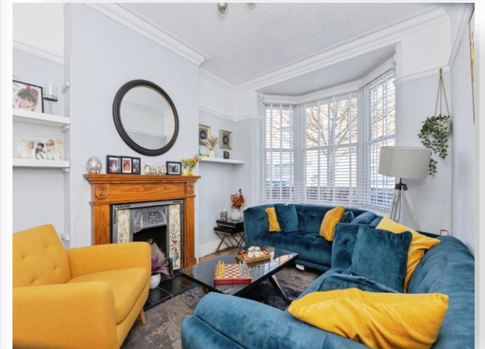
Cambridge Street, Leicester LE3 0JP