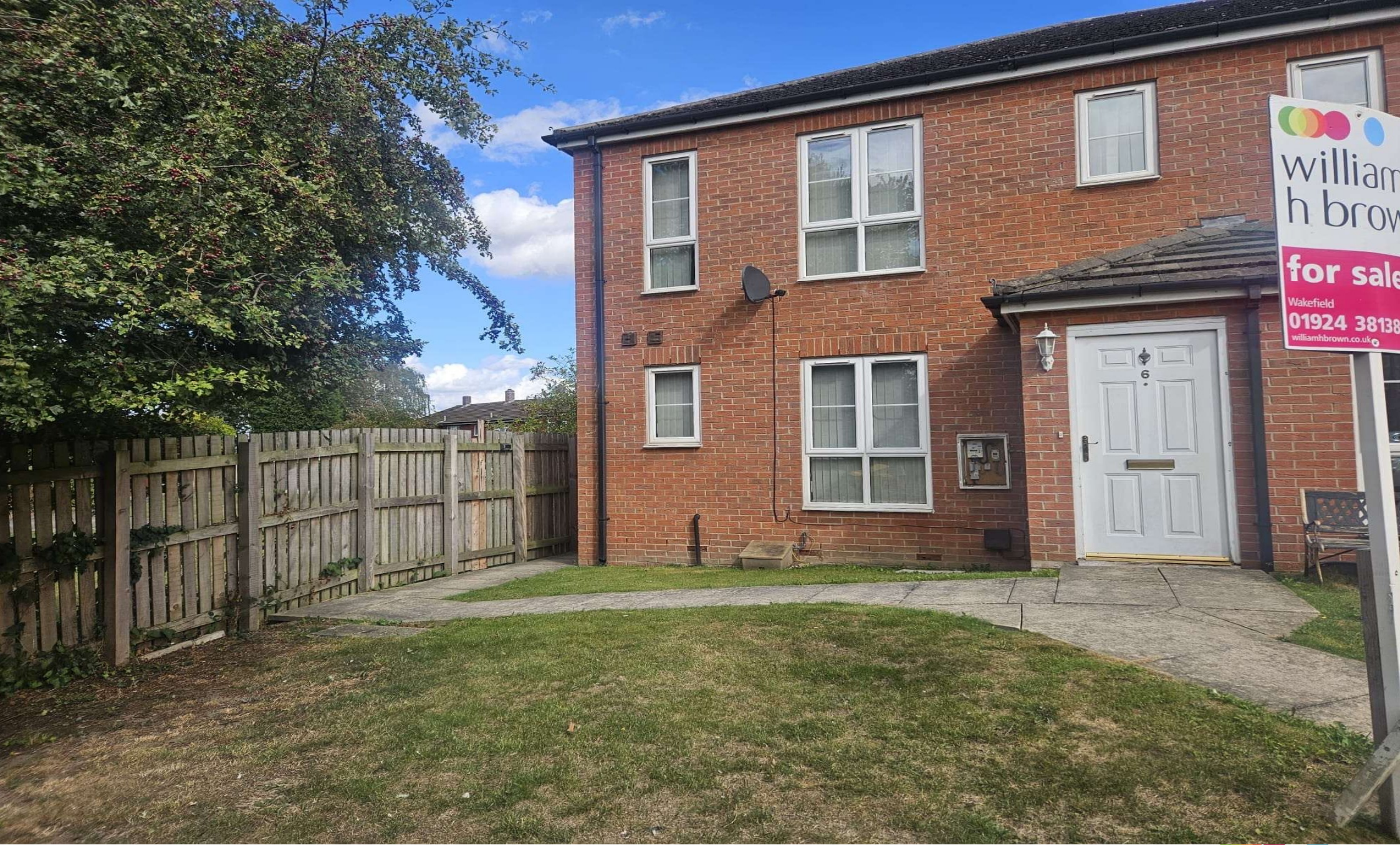
Crofters Court, Havercroft Wakefield WF4 2PW