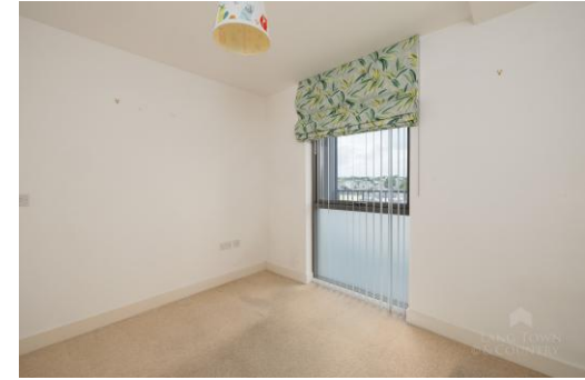
30'7" x 13'0" 9.31m x 3.97m