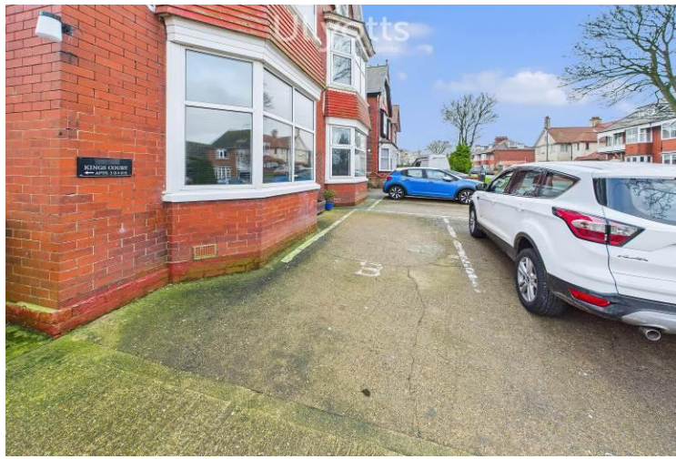
Allocated Parking Space