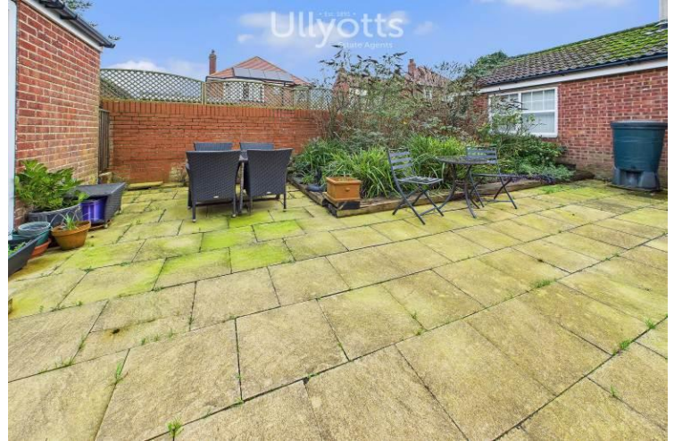
Communal Patio Garden