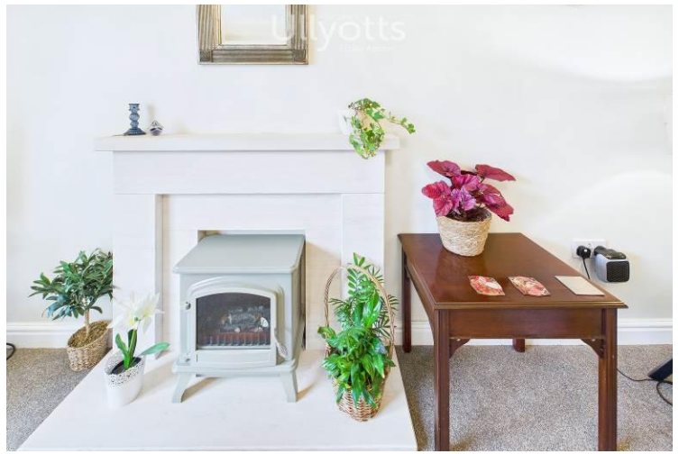
Feature Fire Place