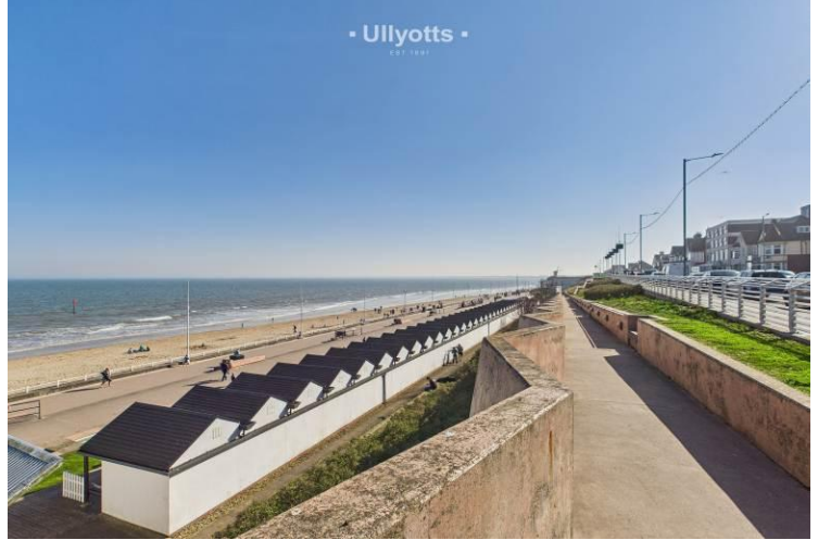
Nearby Southside Beach