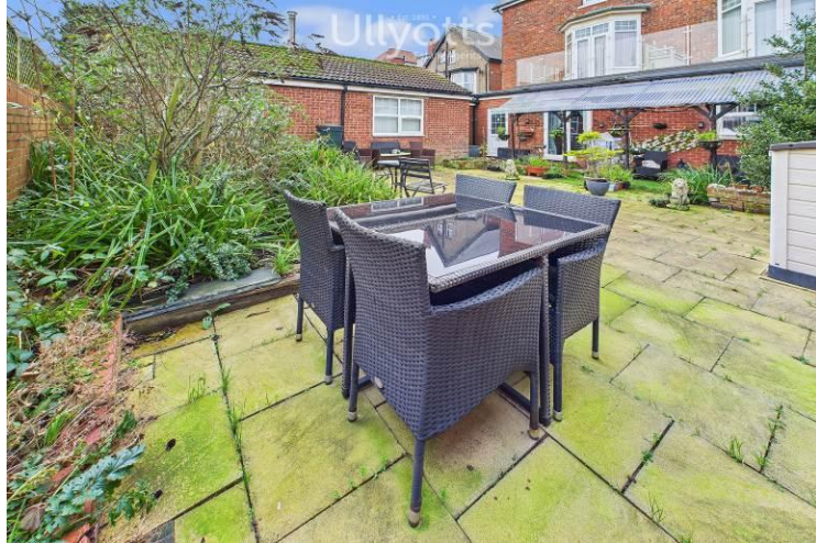
Communal Patio Garden