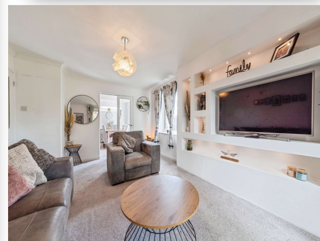
Jackson Court, Farndon Newark NG24 3TS