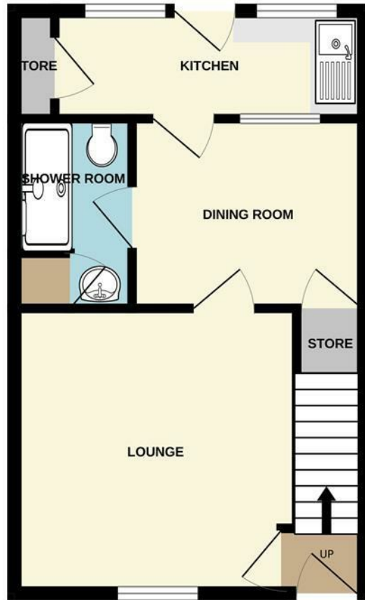
GROUND FLOOR 345 sq.ft. (32.0 sq.m.) approx.