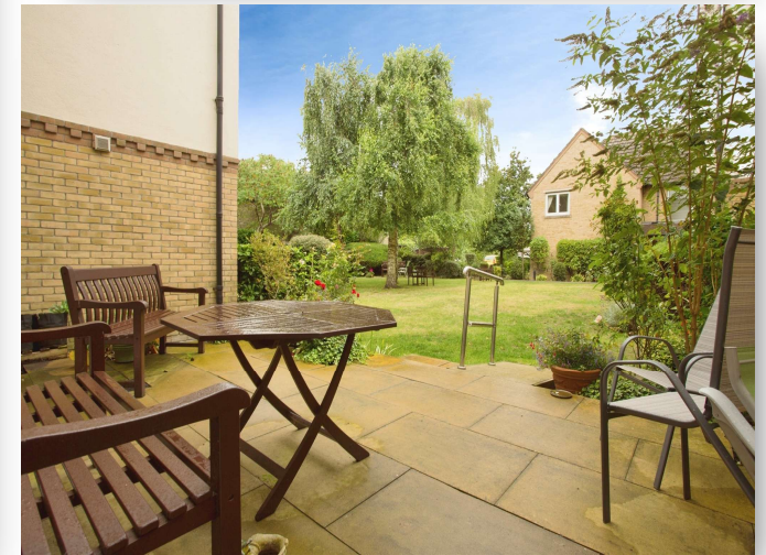
Haig Court, Cambridge, CB4 1TT