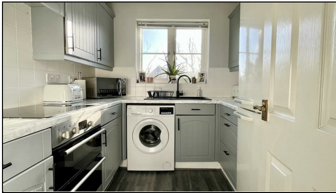
Warren House Court, Sutton Coldfield, B76 1TU