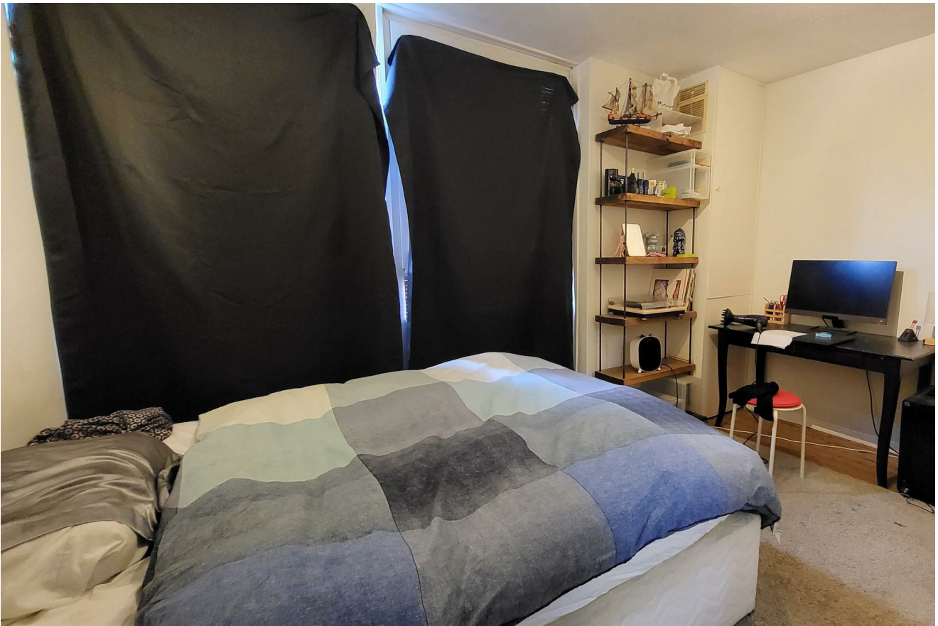
BEDROOM 2 12'9 x 9'2 (3.89m x 2.79m) Double glazed tilt & casement window to the rear. Wooden floorboards & radiator.