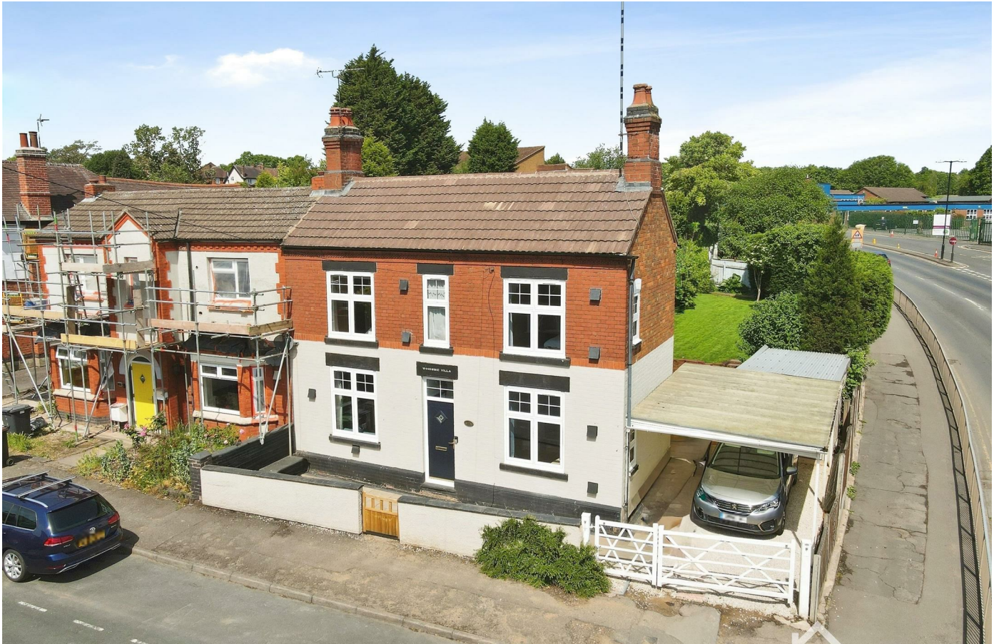
Chapel Street, Bedworth