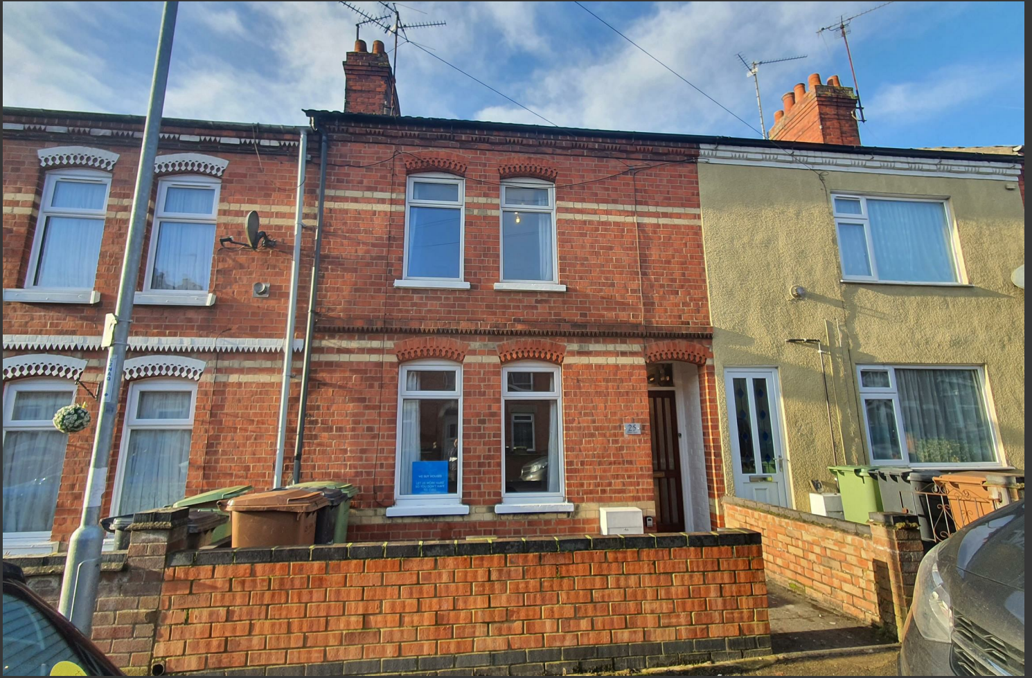
Bedale Road, Wellingborough NN8 4ER £550 PCM