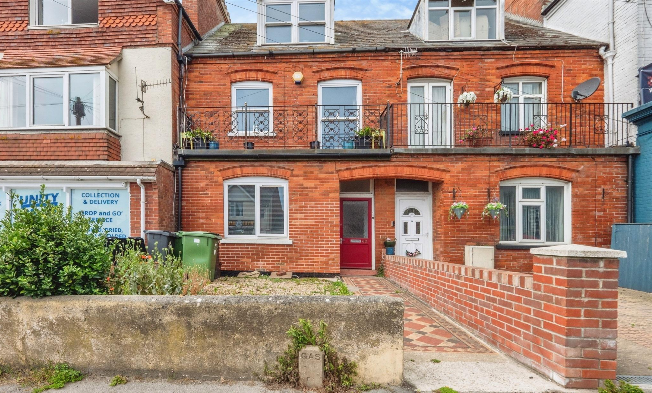
Portland Road, Weymouth DT4 9AB