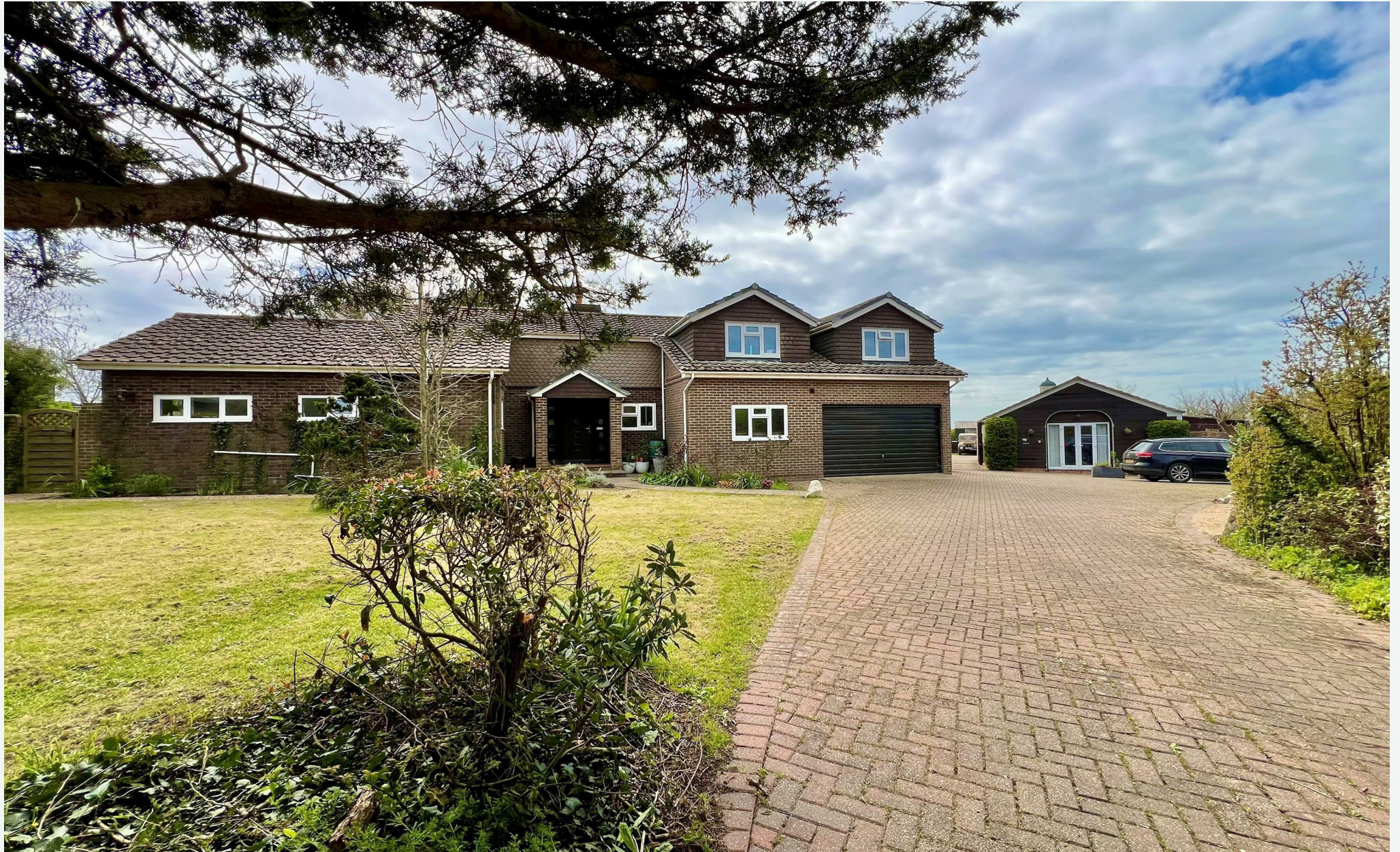
Moorfield Chase, Chilton Lane, Brighstone, Isle of Wight, PO30 4DR