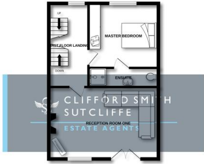
FIRST FLOOR 476 sq.ft. (44.2 sq.m.) approx.