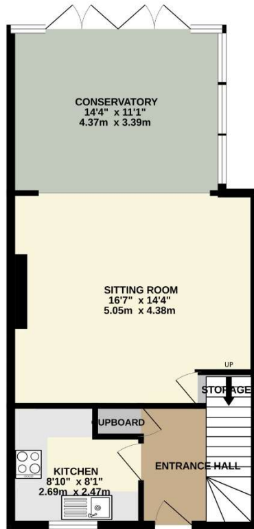
GROUND FLOOR 527 sq.ft. (49.0 sq.m.) approx.