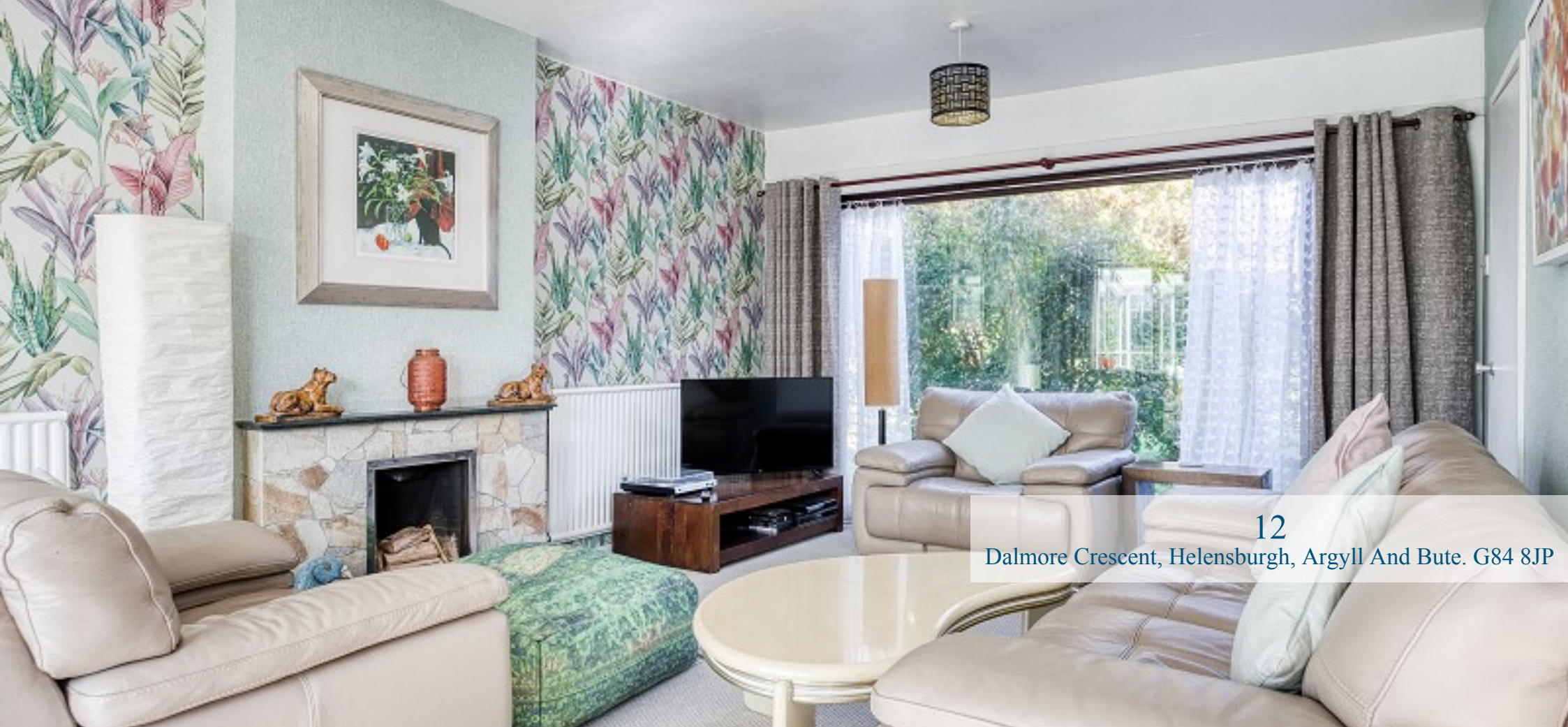
12 Dalmore Crescent, Helensburgh, Argyll And Bute. G84 8JP