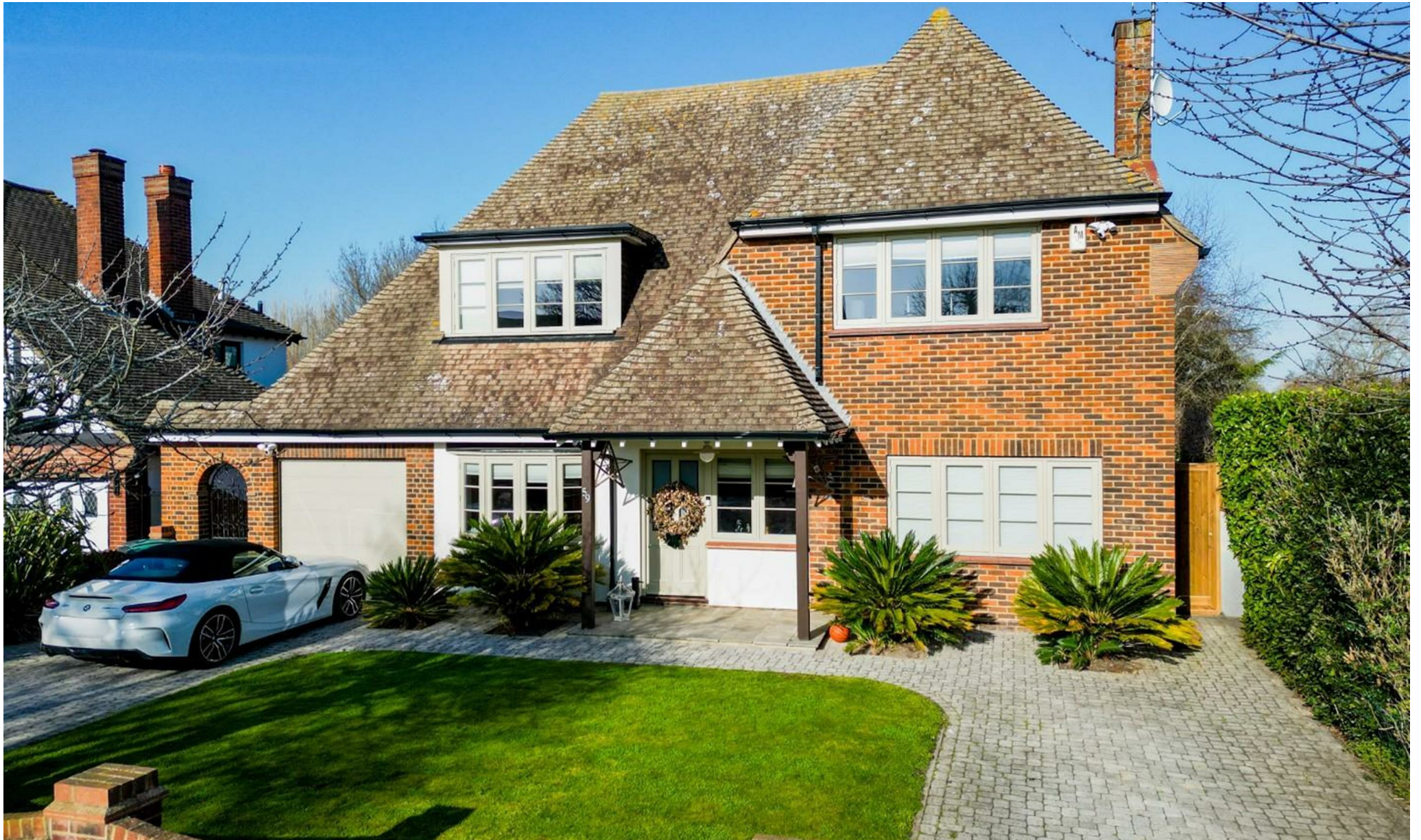
Colbert Avenue, Thorpe Bay £1,175,000