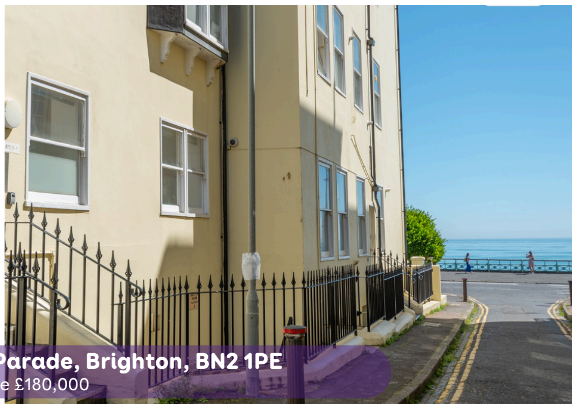
Chain Pier House, Marine Parade, Brighton, BN2 1PE Asking Price £180,000