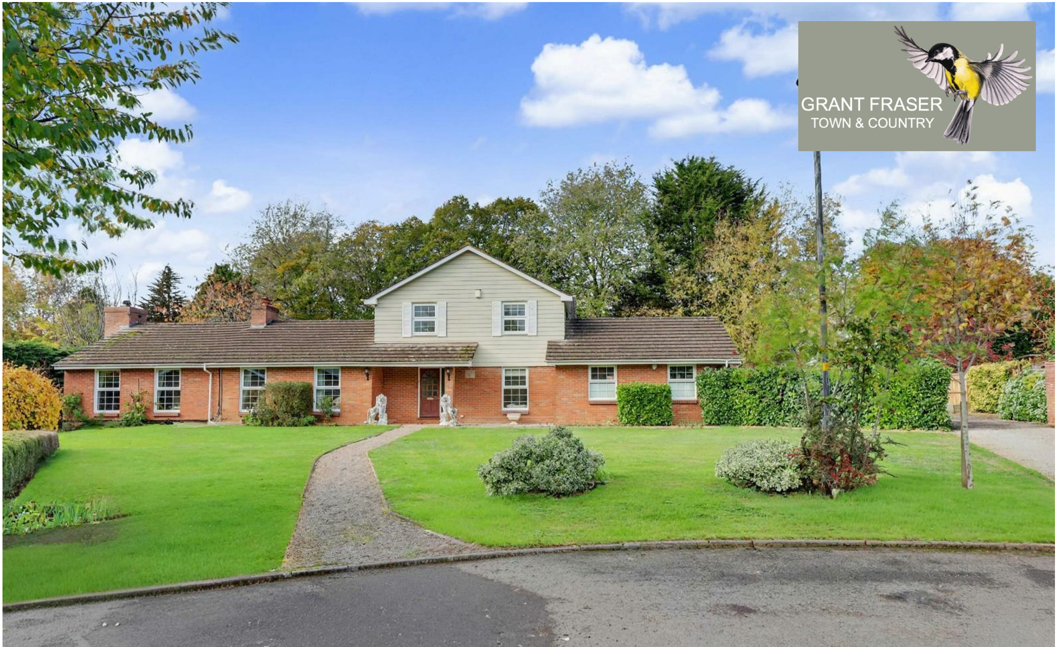
23 Brettingham Gate, Broome Manor, Swindon, Wiltshire, SN3 1NH Guide price £825,000