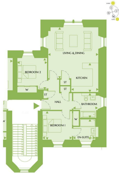
Dimensions and layouts are for guidance only. See full disclaimer on final page of this brochure.