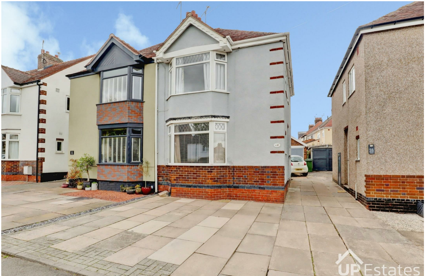
Glenfield Avenue, Nuneaton