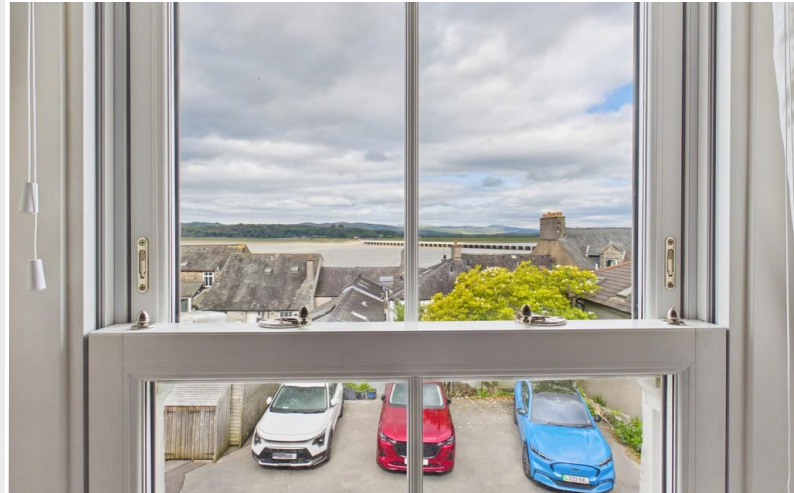
Estuary Views from Bedroom One