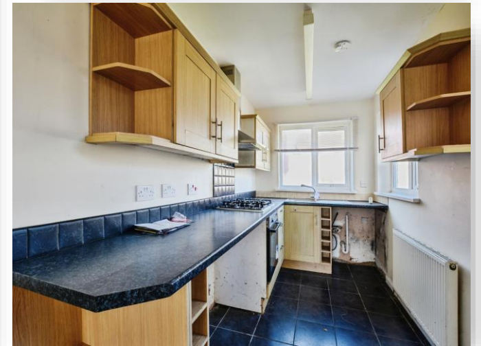
Edward Crescent, Skegness PE25 3SA