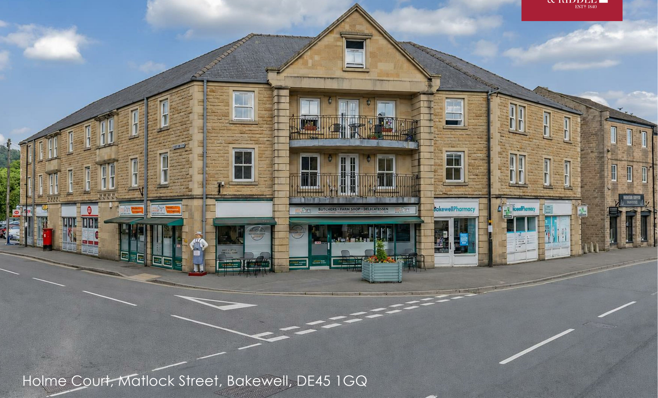
Holme Court, Matlock Street, Bakewell, DE45 1GQ