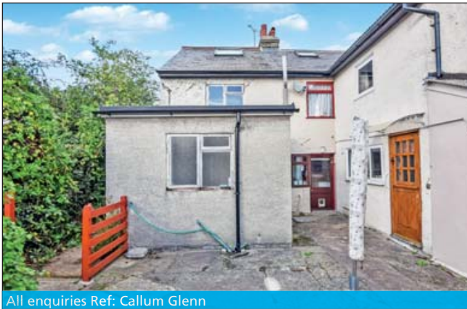
All enquiries Ref: Callum Glenn