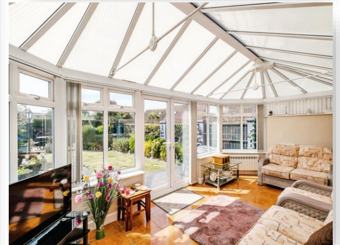
Thirlmere Crescent, Sompting Lancing BN15 9UE