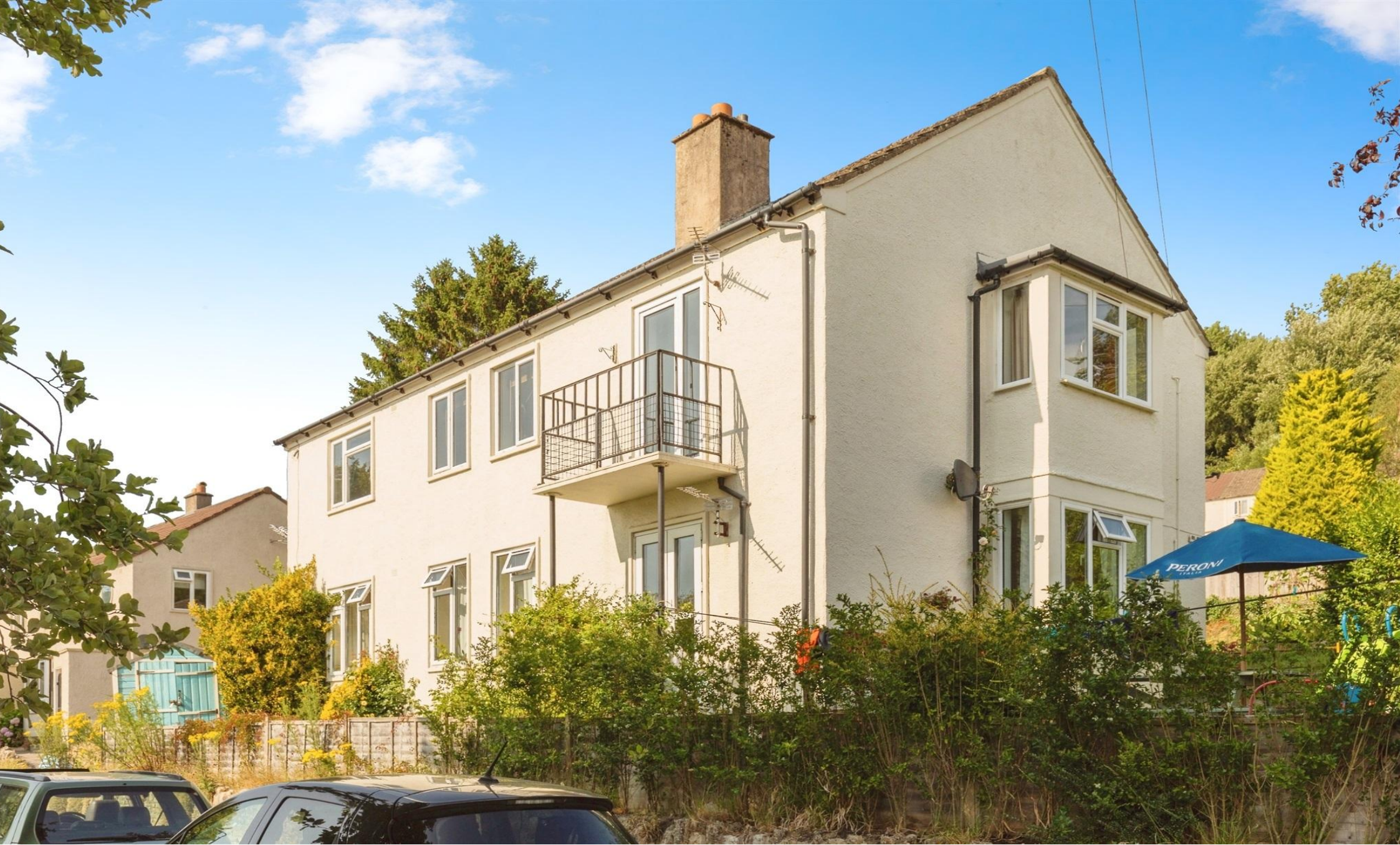
Elmhurst Estate, Batheaston, Bath, BA1 7NR