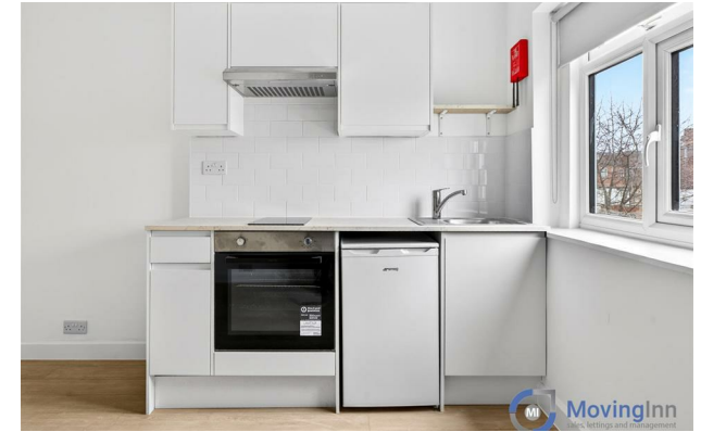
SECOND FLOOR 167 sq.ft. (15.5 sq.m.) approx.