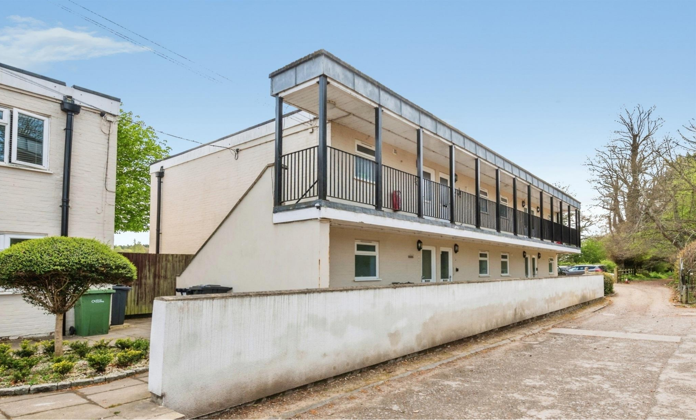
Mongewell Court, Mongewell, Wallingford OX10 8BU