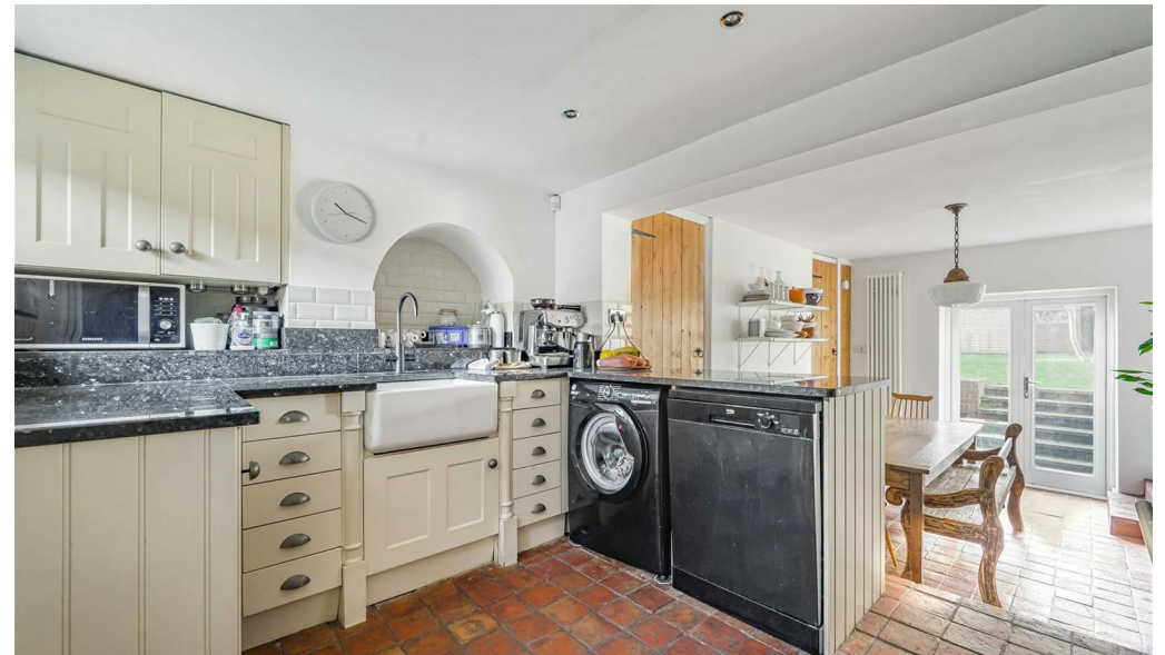
The Cottage, Vicarage Road, Bexley DA5 2AL Guide Price £475,000