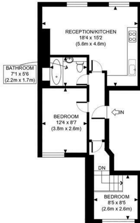
FIRST FLOOR GROSS INTERNAL FLOOR AREA 526 SQ FT