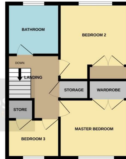
1ST FLOOR 451 sq.ft. (41.9 sq.m.) approx.