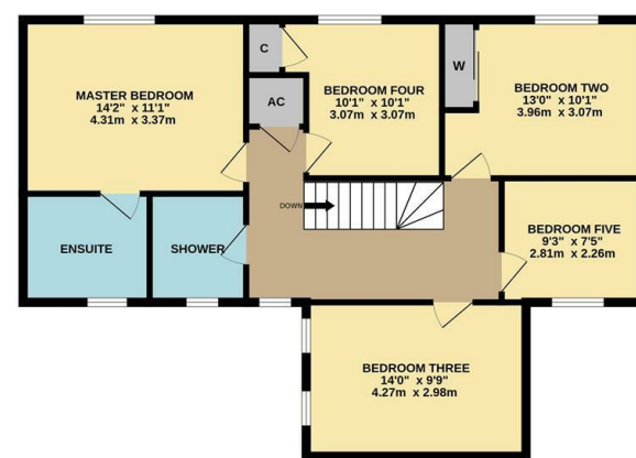
TOTAL FLOOR AREA: 2014 sq.ft. (187.1 sq.m.) approx.

Whilst every attempt has been made to ensure the accuracy of the floorplan contained here, measurements of doors, windows, rooms and any other items are approximate and no responsibility is taken for any error, omission or mis-statement. This plan is for illustrative purposes only and should be used as such by any prospective purchaser. The services, systems and appliances shown have not been tested and no guarantee as to their operability or efficiency can be given.