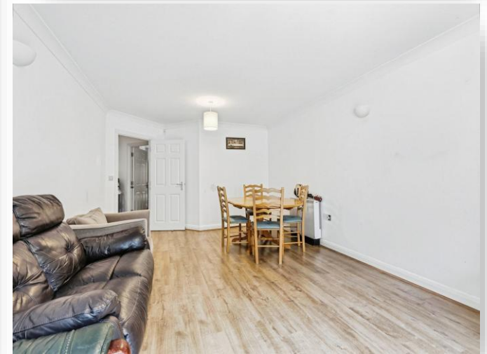
Bradgate House, Billing Road, Northampton NN1 5BH