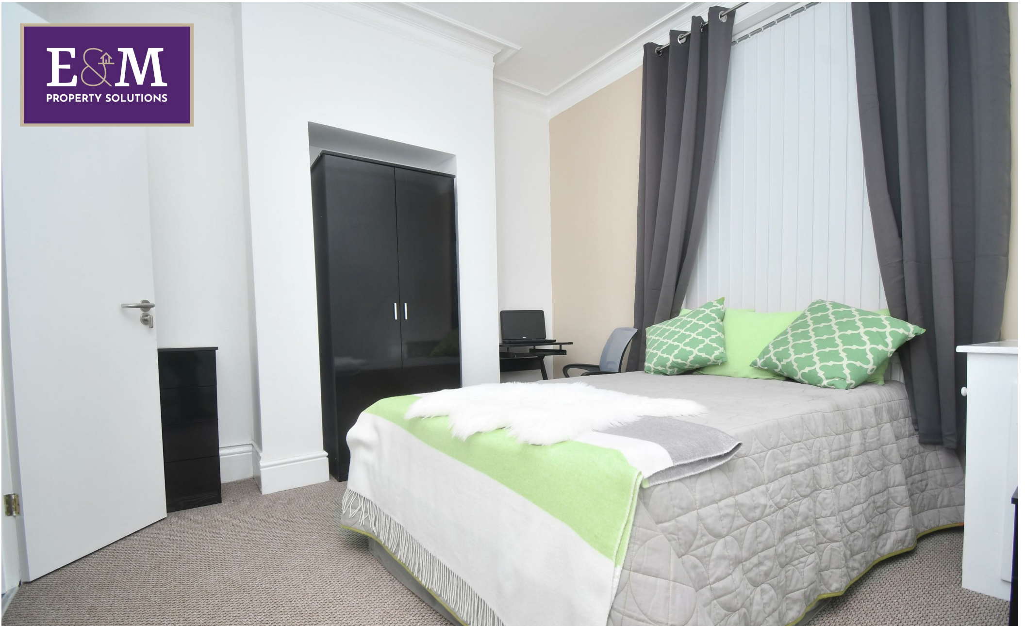
room 3, 14 Lebanon Street, Burnley, Lancashire, BB10 4DF £105 Per week