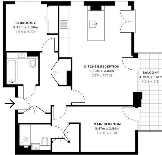
— Eighth Floor