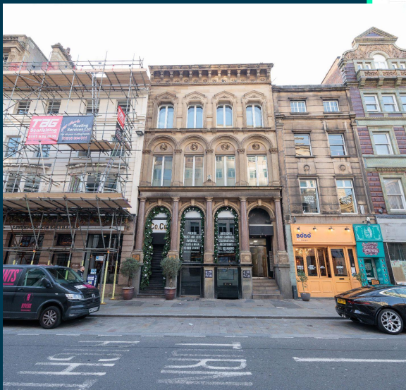
Mason House, Liverpool, L2