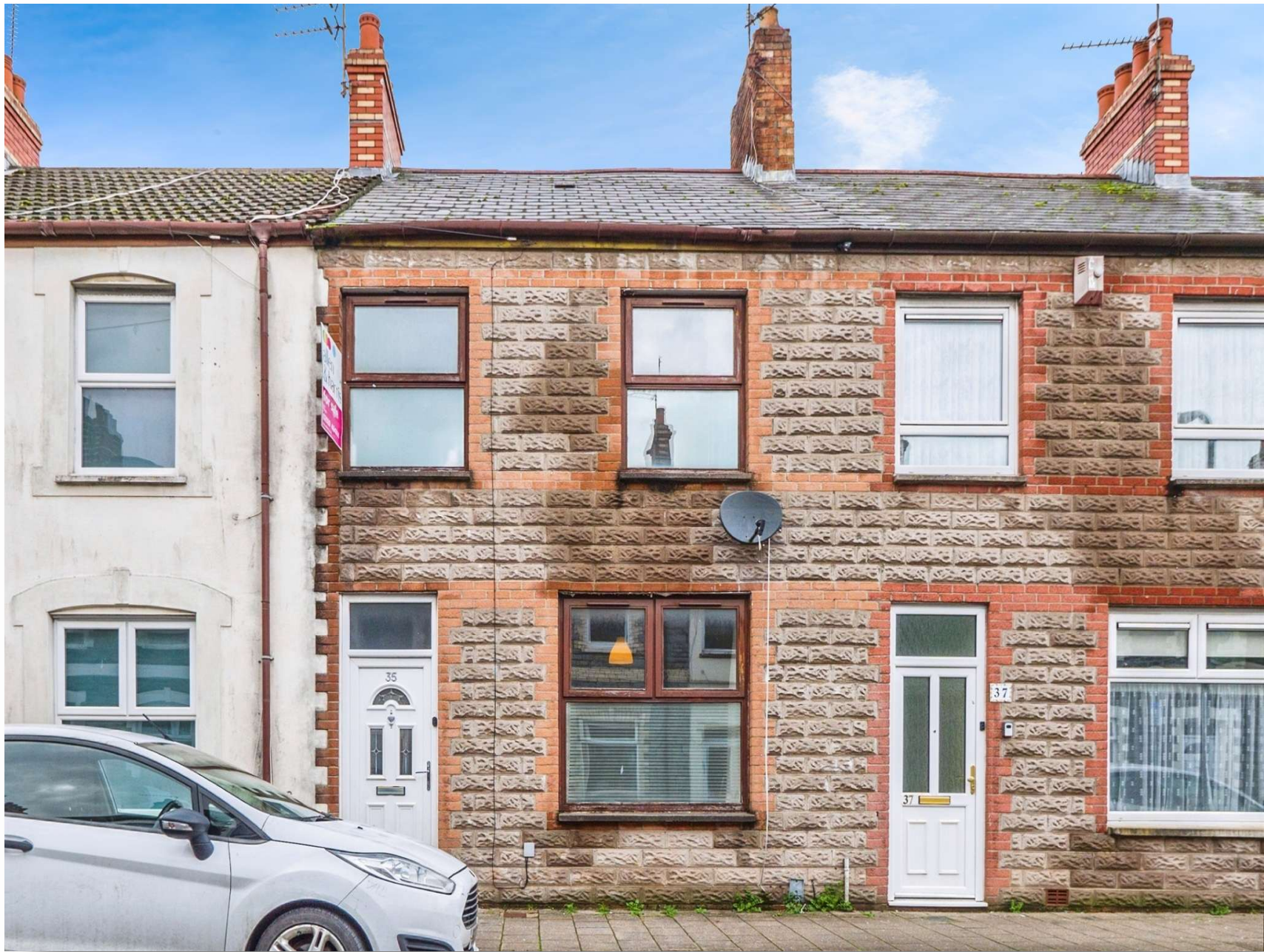
Topaz Street, Adamsdown Cardiff CF24 1PG