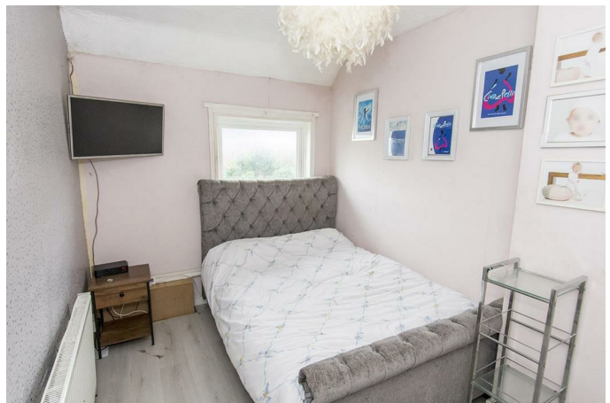
UPVC double-glazed window to rear. Radiator.