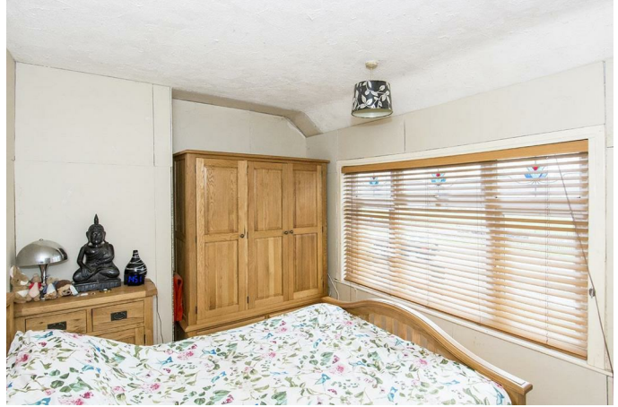
UPVC double-glazed window to front with Welland Park views. Vertical radiator. Requiring plastering to walls.