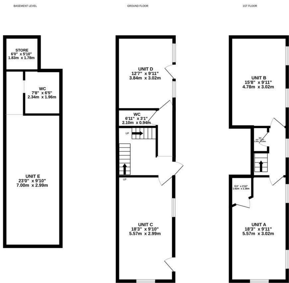
43 OLD BETHNAL GREEN ROAD (5 x COMMERCIAL UNITS)

NB - Tenants are responsible for monthly rental payments, metered electric, business rates (If applicable) broadband & commercial waste management.