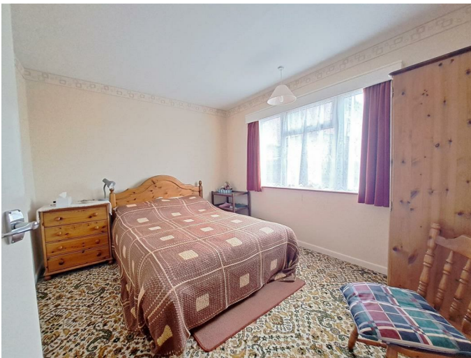
Bedroom Three 12'11 x 9'10 (3.94m x 3.00m)