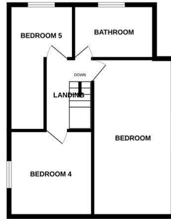
1ST FLOOR 505 sq.ft. (46.9 sq.m.) approx.