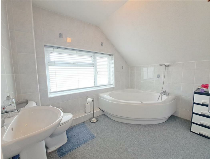
Bathroom 9'7 x 6'11 (2.92m x 2.11m)