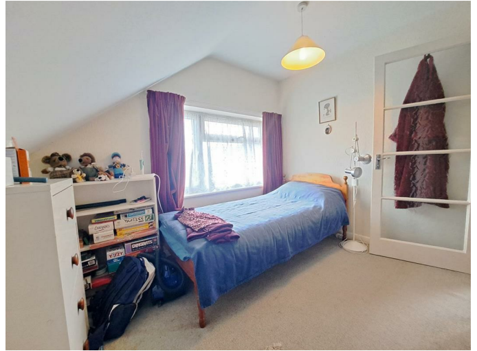
Bedroom Five 15'4 max x 9'11 max (4.67m max x 3.02m max )