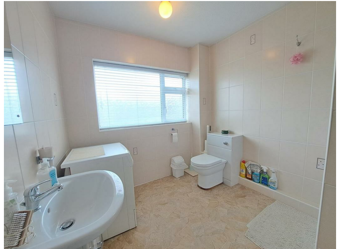
Shower/Utility Room 10'6 x 7'11 (3.20m x 2.41m)