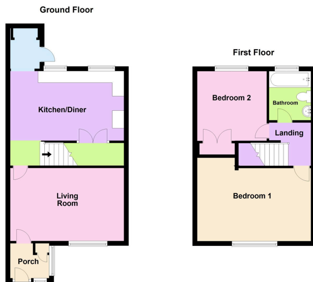
This plan is to be used only as an indication of the floor layout and is not to scale. Plan produced using PlanUp.