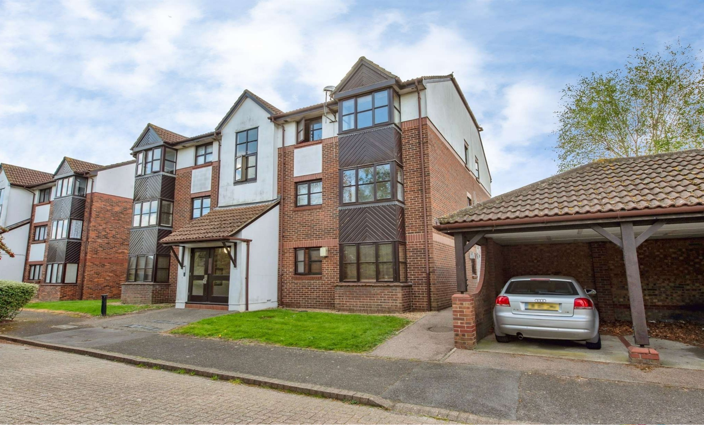
Banner Close, Purfleet-On-Thames RM19 1RN