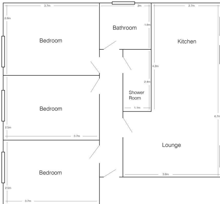
5 Headingley Rise (drawing not to scale)

Modern flat in purpose built block with parking and close to local shops in central Hyde Park. Open plan lounge with sofa's, modern fitted kitchen. 3 good sized double bedrooms furnished with double bed, large wardrobe, chest of drawers, desk and chair. fully tiled bathroom with bath and separate shower room. double glazed and gas central heated throughout.