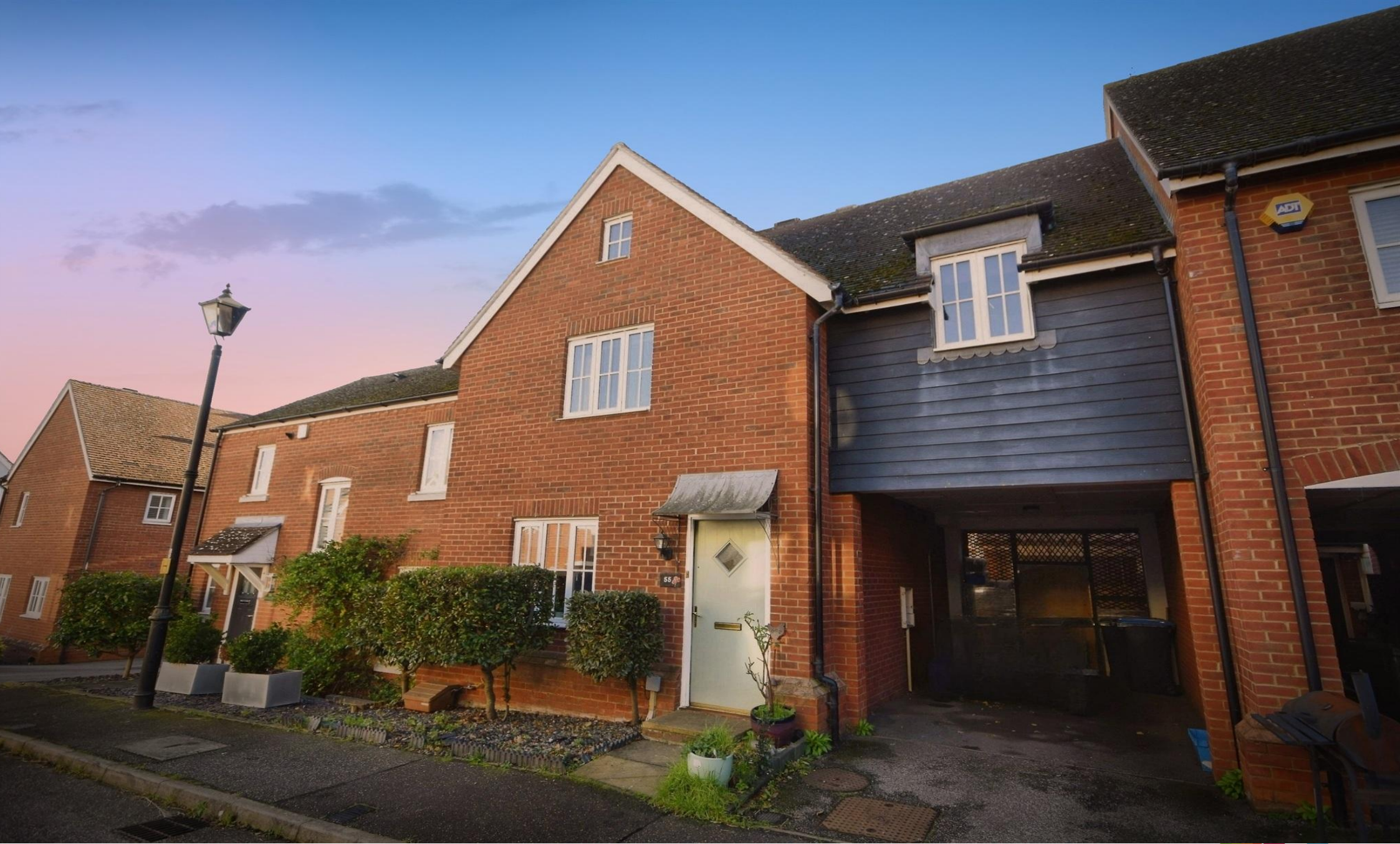
The Gables, Ongar, CM5 0GA