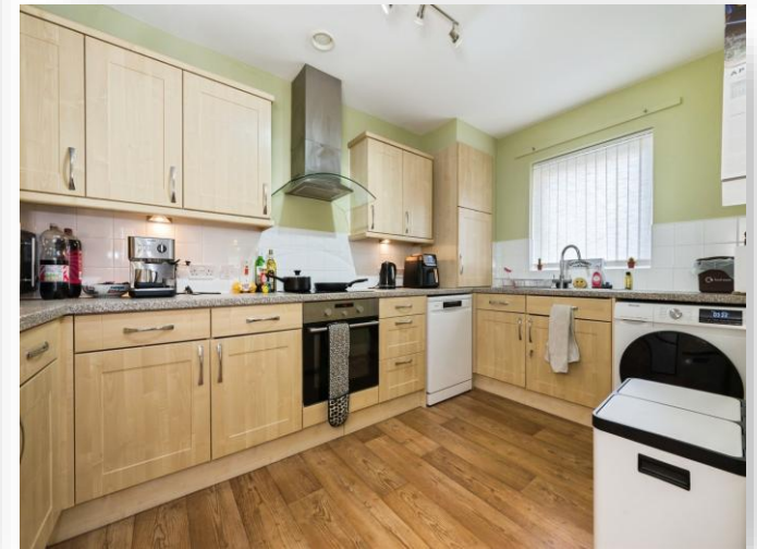
Chamberlayne House, Robin Place, Netley Abbey, Southampton SO31 5HY