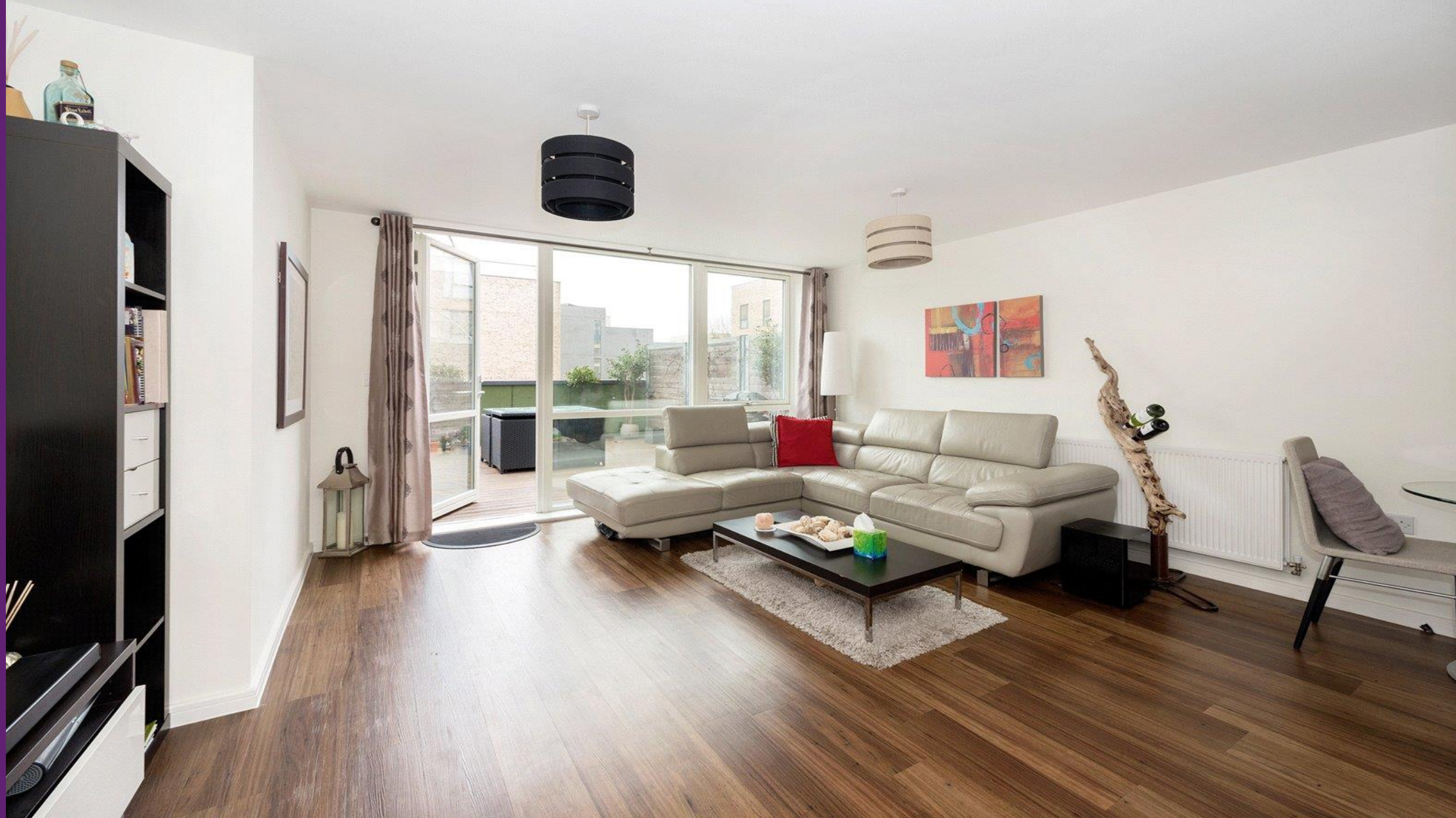
Herrick Court Bollo Bridge Road, W3