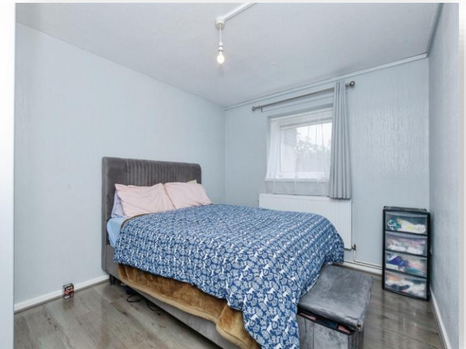
Kelbrook Close, Leicester LE4 0US