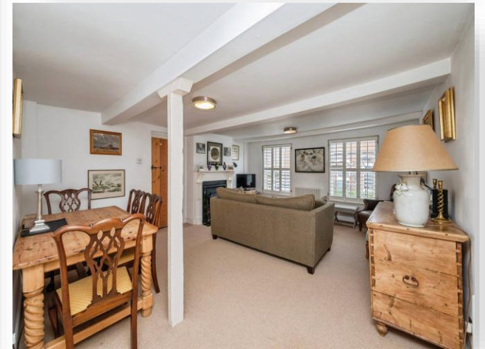
Millgate, Aylsham, Norwich, NR11 6HX