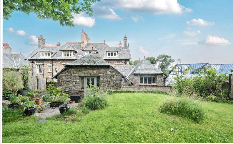
Rear Garden and Rear Elevation

Anti-Money Laundering Regulations Please note that when an offer is accepted on a property, we must follow government legislation and carry out identification checks on all buyers under the Anti-Money Laundering Regulations (AML). We use a specialist third-party company to carry out these checks at a charge of £60.00 (inc. VAT) per individual or £50.00 (incl. vat) per individual, if more than one person is involved in the purchase (provided all individuals pay in one transaction). The charge is non-refundable, and you will be unable to proceed with the purchase of the property until these checks have been completed. In the event the property is being purchased in the name of a company, the charge will be £150 (incl. vat).