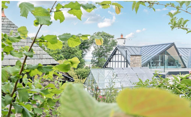
Elevated Views from the Rear Garden